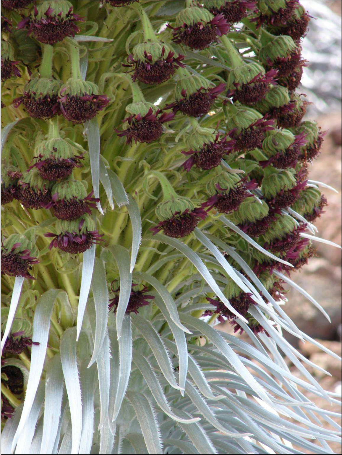
Flowering silversword (1 of 138 this year). Summit Parking Lot. Sep. 24, 2006.